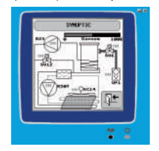
LyoAlfa 10/15 control panel screens

This model incorporates unique and high level control performances, as well as excellent technical features.