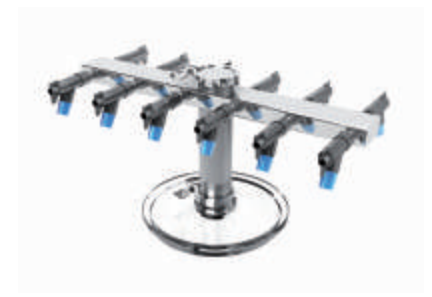
Stackable 12 port manifold with adaptor plate