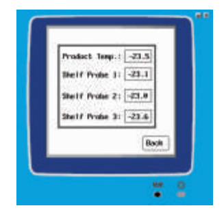
LyoQuest control panel screens

Based on more than 40 years of experience, Telstar introduces the LyoQuest as state of the art in performance and process control. The unit was specifically developed for basic research in biotechnology and scientific institutes.