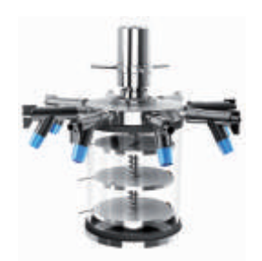
Standard stoppering chamber with 8 port manifold